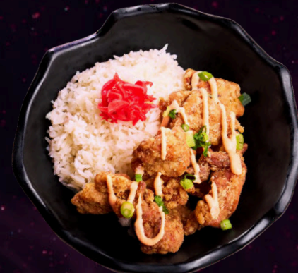
CHICKEN KARAAGE BOWL 19.00

Beef, dashi, pickled red ginger, yellow & green onions, rice.