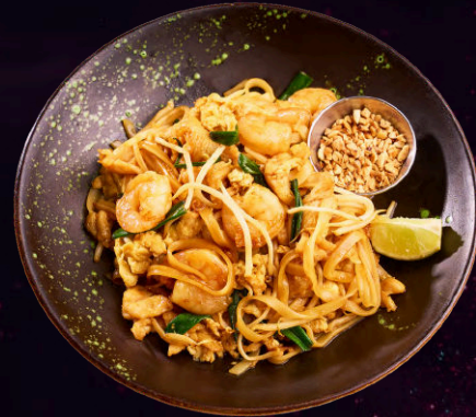
CHICKEN PAD THAI 25.00

Thin egg noodles, chicken, bean sprouts, yellow & green onions.