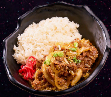
BEEF BOWL 19.00

Pork chashu, pickled red ginger, green onion, rice.