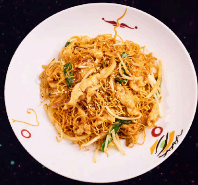
CHICKEN CHOW MEIN 22.00

Thin egg noodles, chicken, bean sprouts, yellow & green onions.