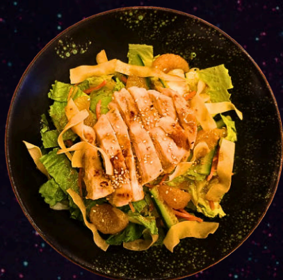
CHINESE CHICKEN SALAD 18.00

Shrimp, carrot, green pea, egg, yellow & green onions.