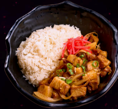
PORK CHASHU BOWL 19.00

Pork chashu, pickled red ginger, green onion, rice.