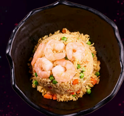
SHRIMP FRIED RICE 22.00

Japanese fried chicken, spicy mayo, pickled red ginger, green onion, rice.